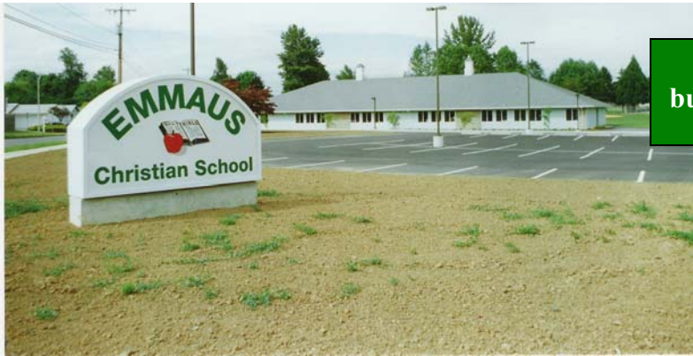
Completion of Phase I of the current building. Phase I currently houses Pre-school through grade 3