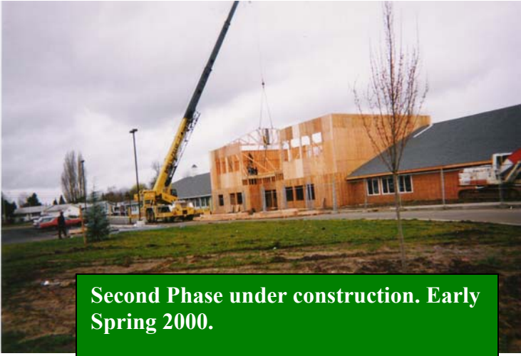
Second Phase under construction. Early Spring 2000.