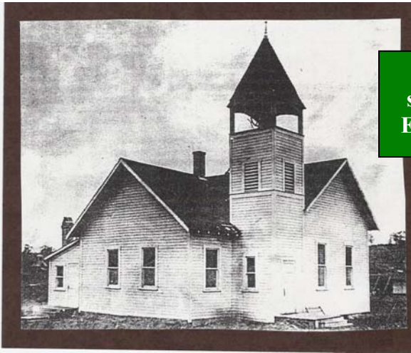
Cove Orchard Community Church located south of Gaston was the original home of the ECS bell. The church was torn down in 1998.